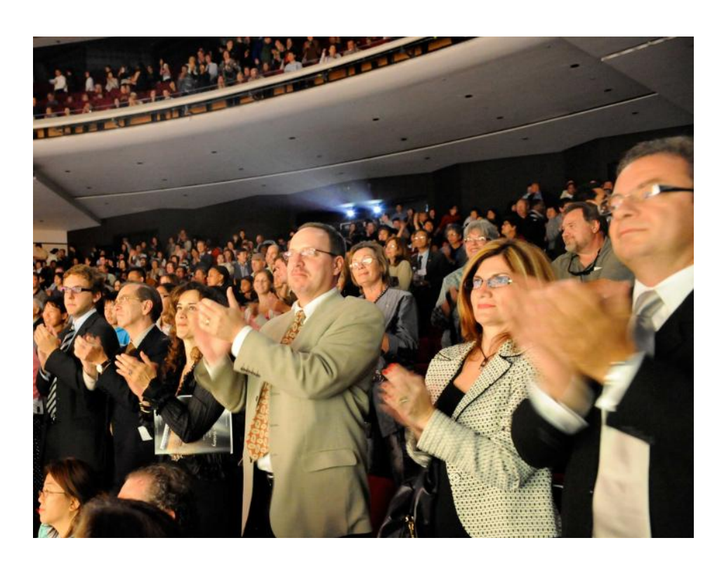
Compliments of Heath Suddleson, DTM